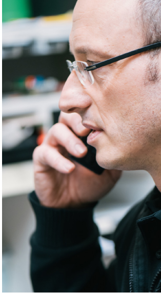
24/7 Lenze expert helpline